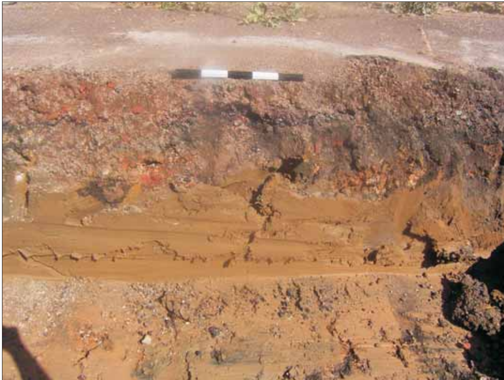
Plate 1: East facing section in Trench 1 (0.5m Scale)