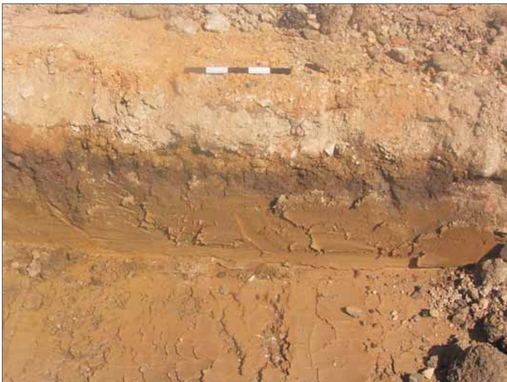
Plate 2: South facing section in Trench 3 (0.5m Scale)