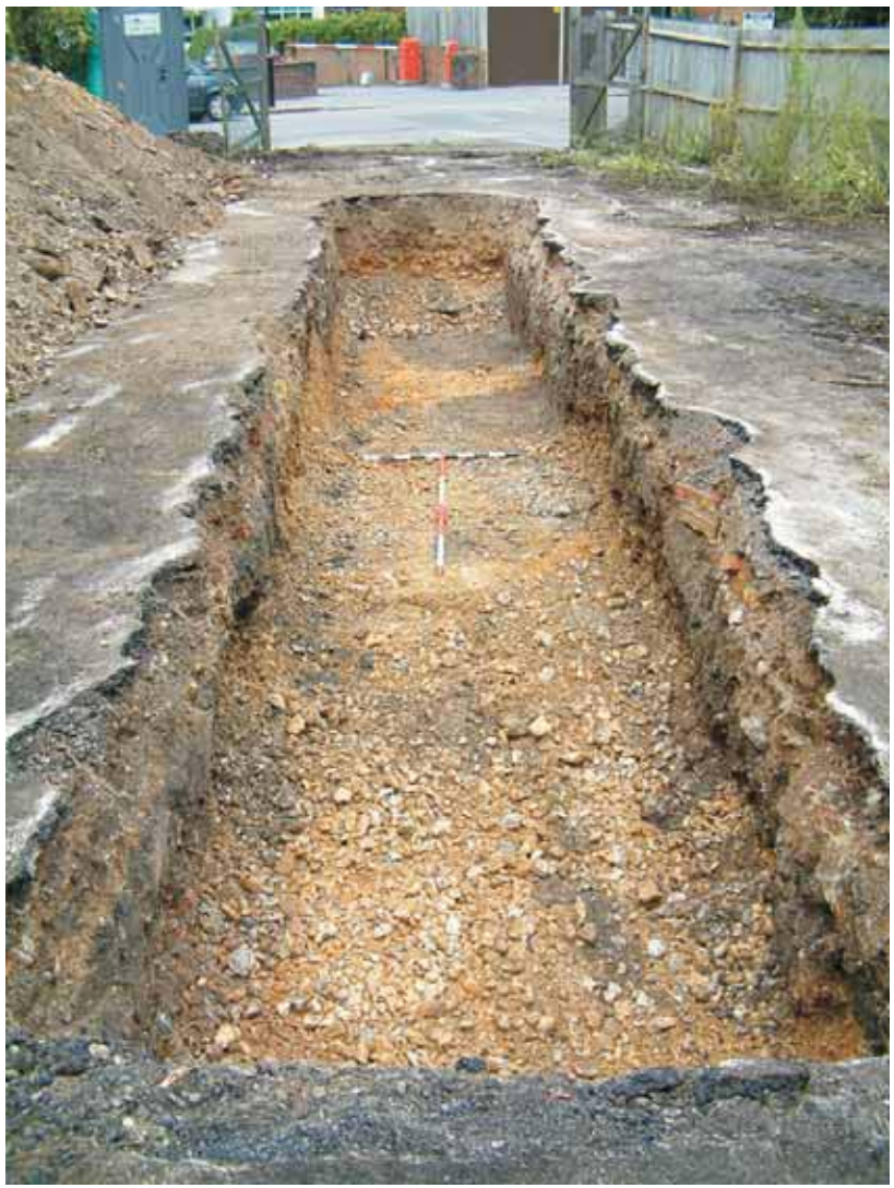
Plate 2. General shot of Trench 5 from the south-east (Scales: 1m, 2m)