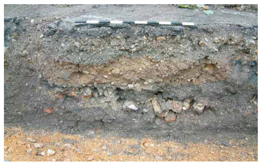
Plate 1. North-east facing section of Trench 4 (Scale:1m)