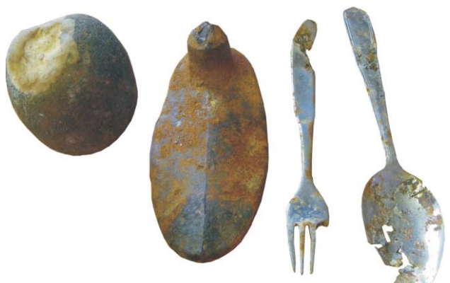
Selection of discoveries from Tarmac Erith

Tarmac Erith is presented the award for Best Attitude by a Wharf for reporting a many and varied collection of finds of different materials. In the past year, Erith have reported 10 finds including cannonballs and cutlery as well as a ship's timber and mammoth tooth. As well as reporting finds, their preliminary reports contain a lot of information, which helps the implementation service to quickly research and determine the significance of the find. Well done Erith and keep up the good work!