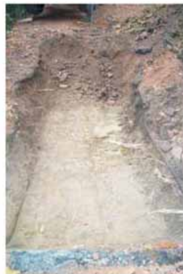
Plate 4: General view of Trench 4 taken from east