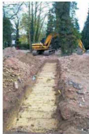
Plate 2: General view of Trench 2 taken from north