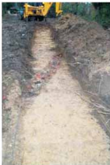
Plate 3: General view of Trench 3 taken from west