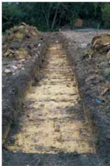
Plate 1: General view of Trench 1 taken from west