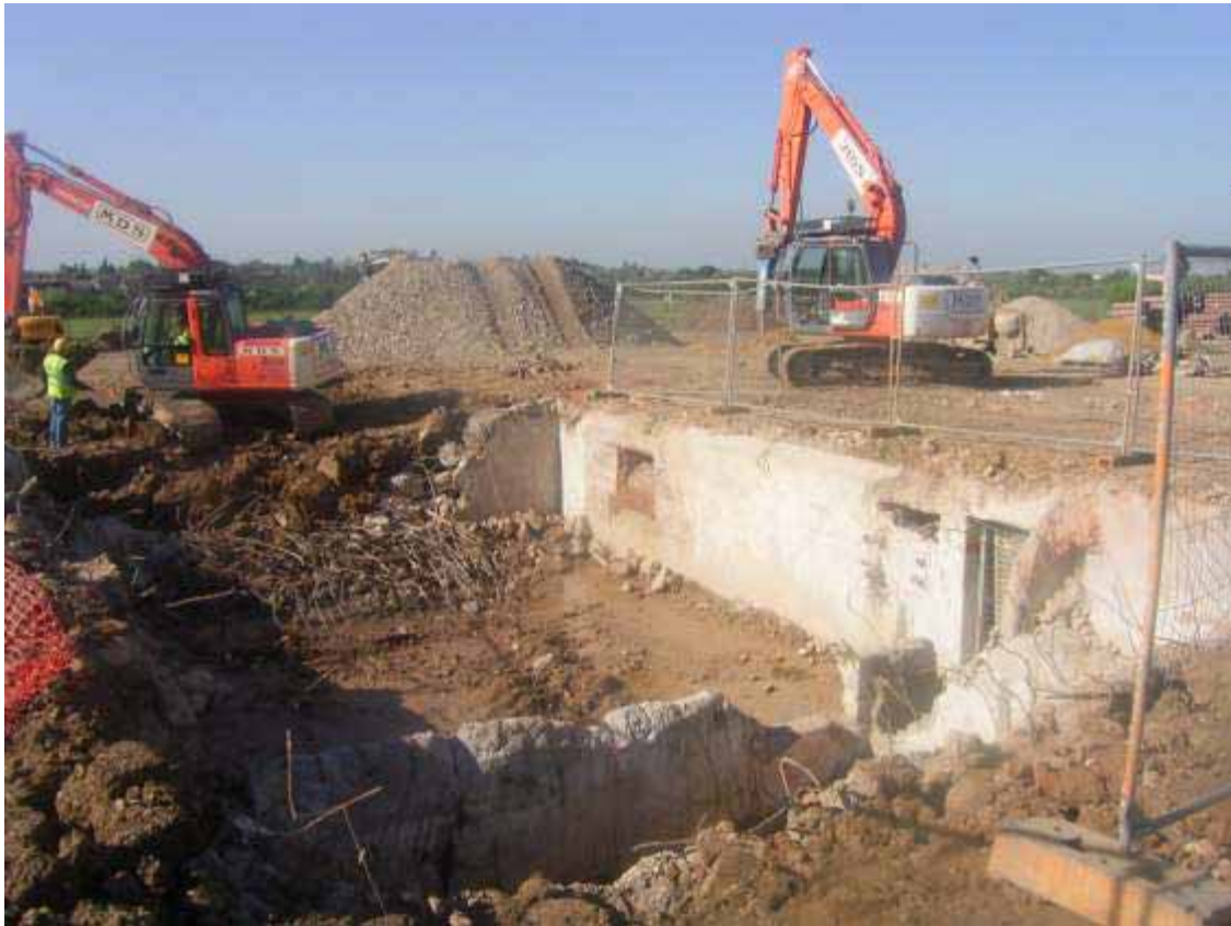
Plate 1. Removal of school building foundations (from north east)