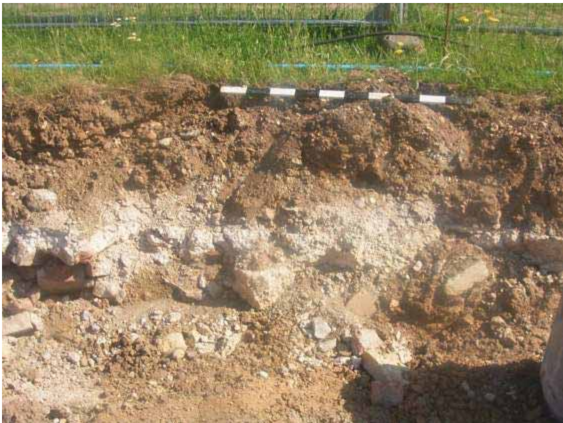
Plate 4. South facing Section 3, with 1m scale