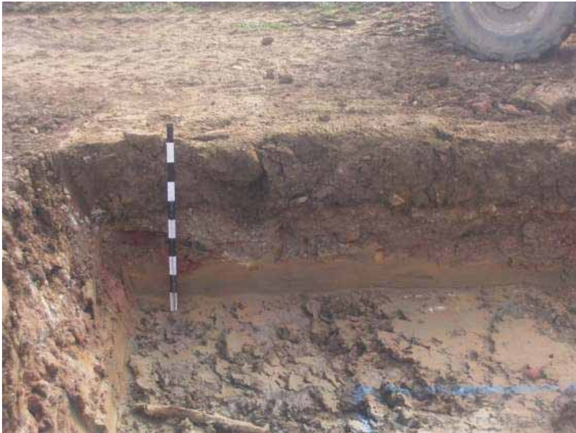
Plate 3. Section 2 from north with 1m scale