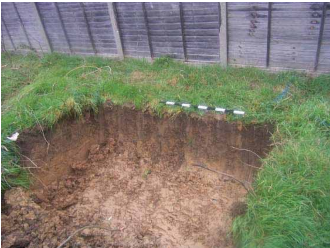
Plate 2. Section 1 (oblique) from southwest with 1m scale