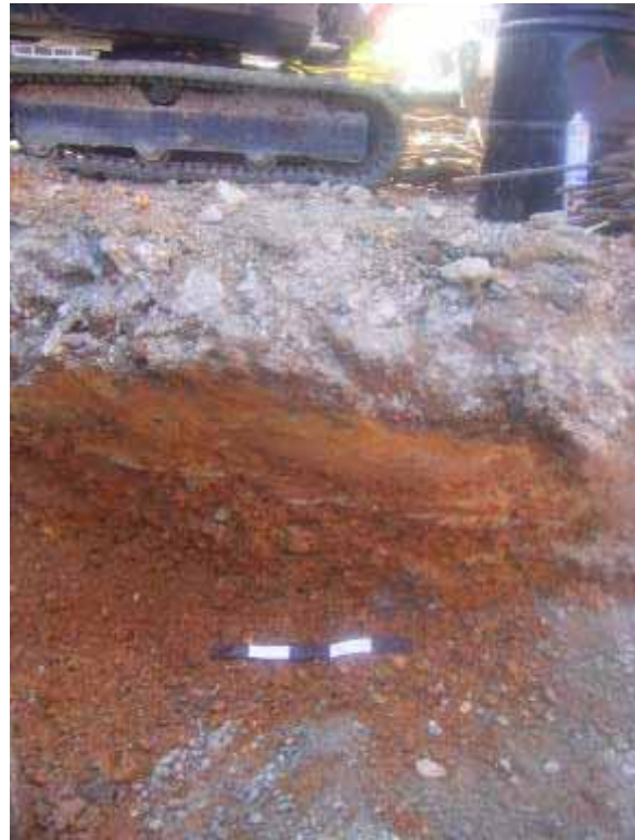
Plate 2: North facing section in south side of lift shaft