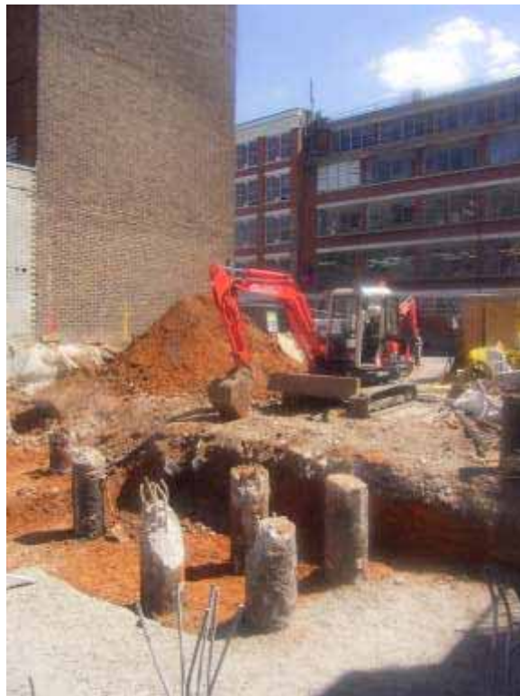
Plate 3: Excavated lift shaft from north-west