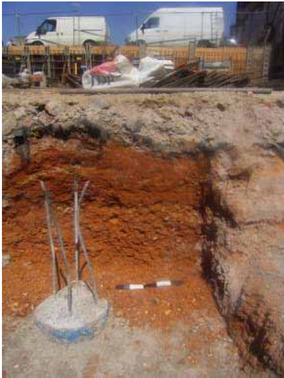
Plate 1: South facing section in north side of lift shaft