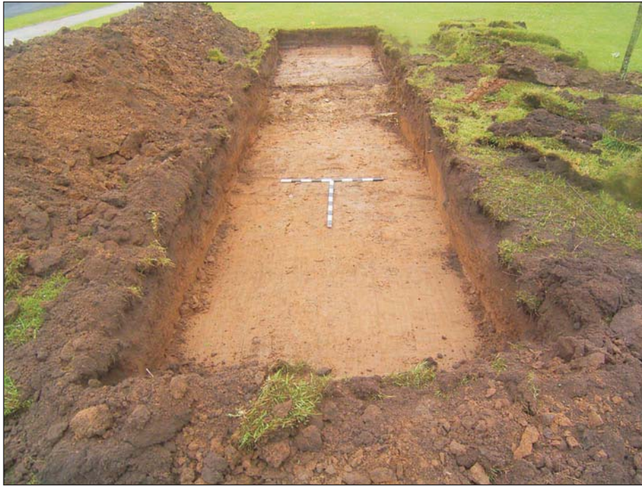
Plate 1: Trench 1 viewed from south