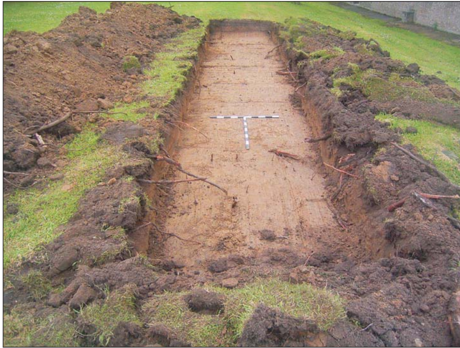
Plate 3: Trench 2 viewed from west