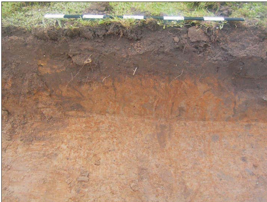
Plate 2: Trench 1 typical soil sequence

This material is for client report only © Wessex Archaeology. No unauthorised reproduction.