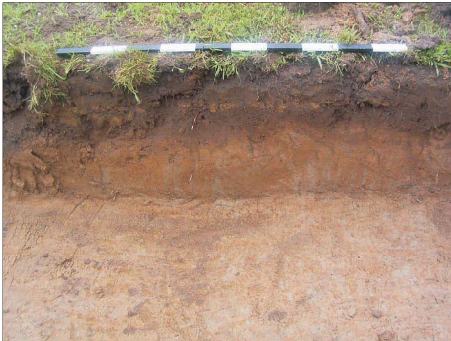
Plate 4: Trench 2 typical soil sequence

This material is for client report only © Wessex Archaeology. No unauthorised reproduction.