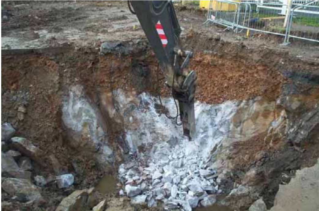
Plate 1: Groundworks for Receiving Hopper from the east