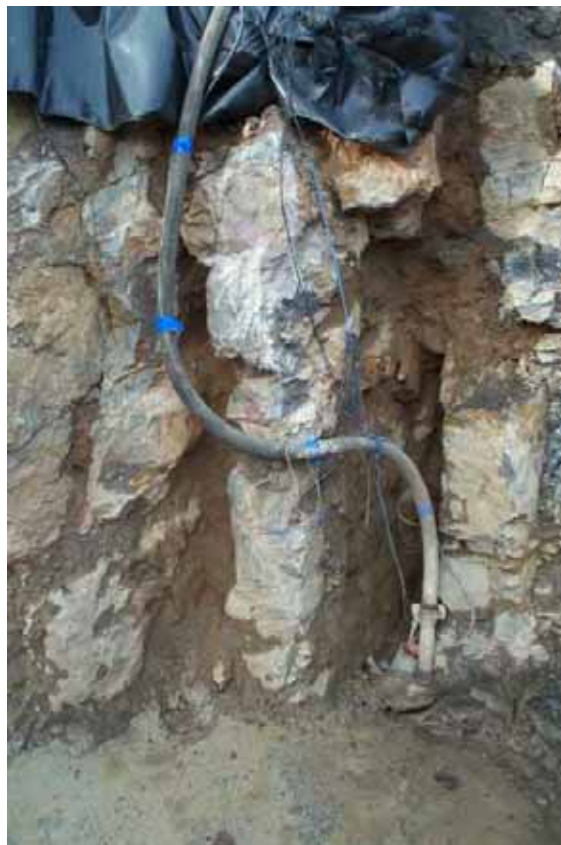
Plate 2: Close-up of fissures

This material is for client report only © Wessex Archaeology. No unauthorised reproduction.