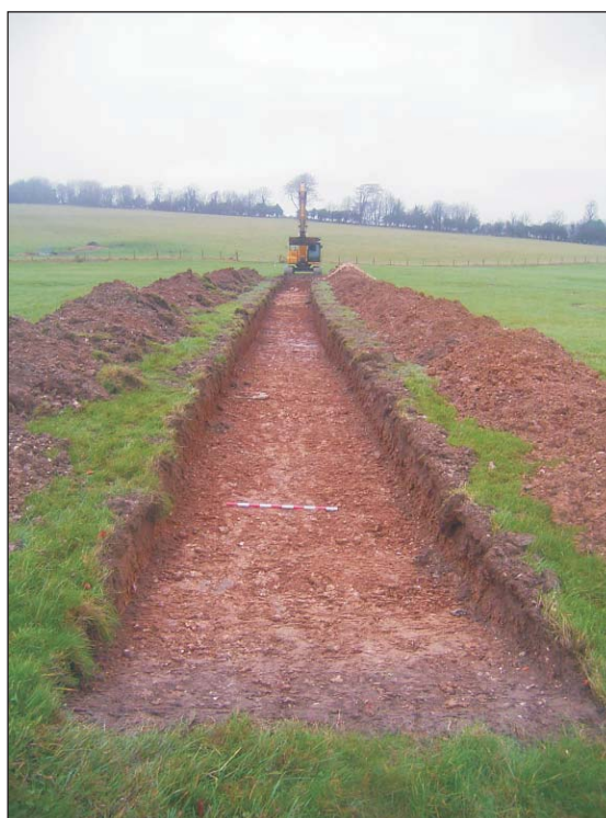
Plate 2: Trench 7