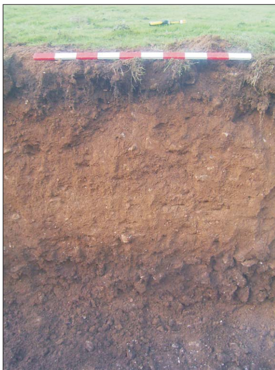
Plate 3: Trench 17, representative section