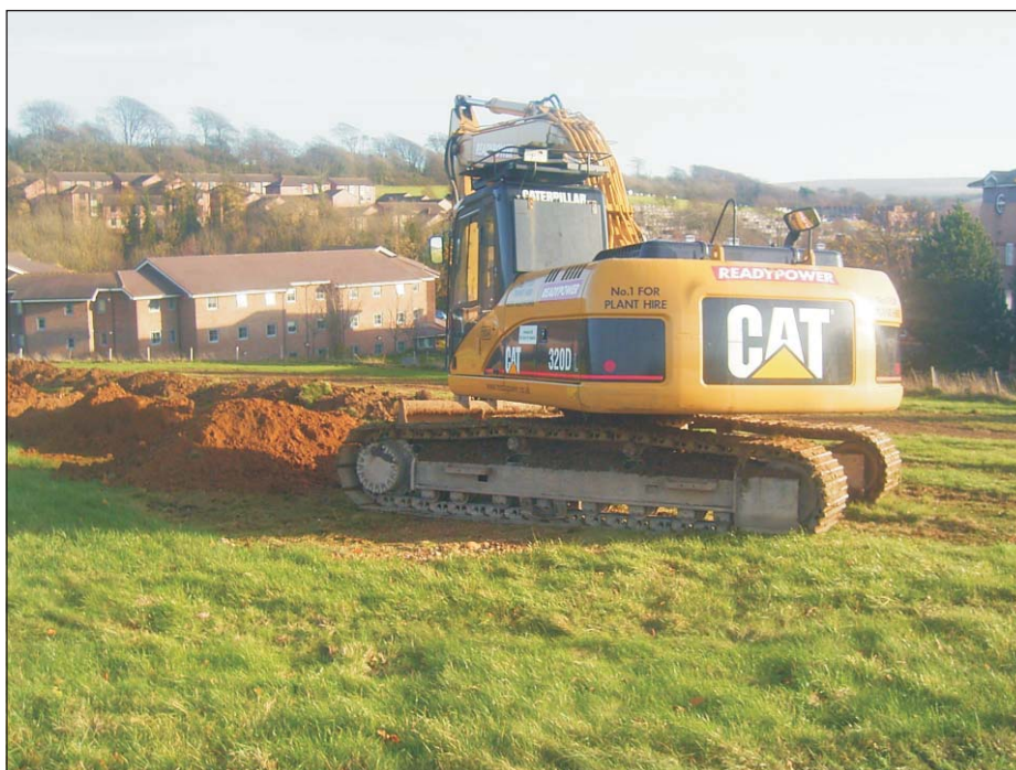
Plate 1: General view