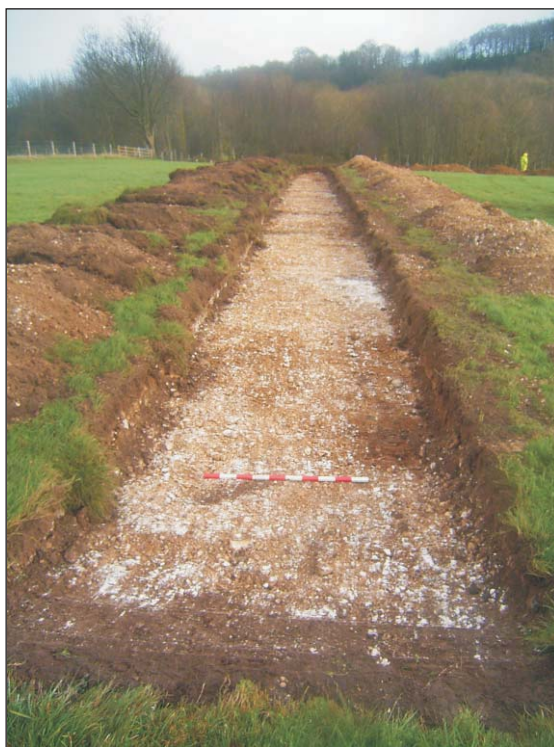
Plate 4: Trench 19